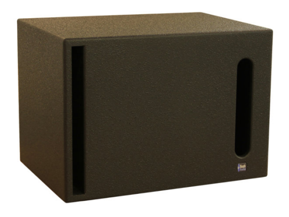
LF12BP - Sub bass loudspeaker

DSP settings and recommended system setups for Hush Audio speakers are available on request.